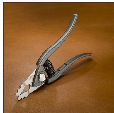
Pliers for rings Big - Réf. 300-PAD-000 Small - Réf. 300-PAD-001