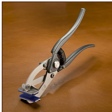
Mole grip pliers Ref. 300-PCP-045