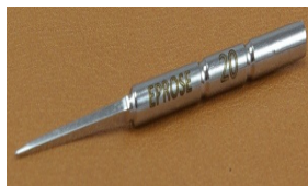
Iron of removable losangique awl 20 mm