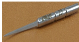
Iron of removable losangique awl 25 mm