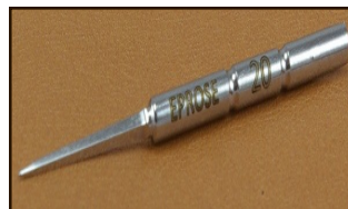
Iron of removable losangique awl 20 mm