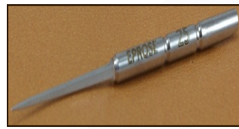
Iron of removable losangique awl 25 mm