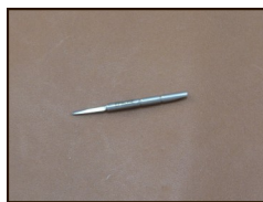
Iron of removable losangique awl 15 mm